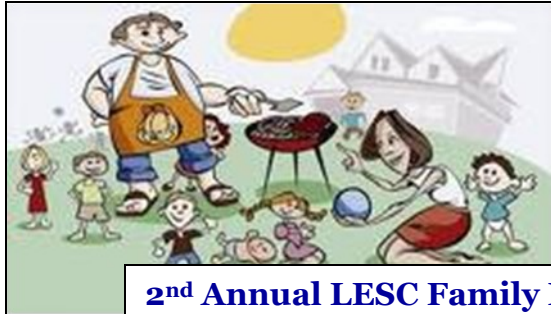
2 nd Annual LESC Family BBQ